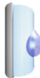
1 Micron Filter